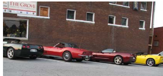
Vettes at the Tic Toc

I had no clue what the Tic Toc Ice Cream Parlor in Loudon was all about, but it didn't take long to figure it out! If you like ice cream, you need to take a trip to Loudon! It's a "cool" place to pick up a cone of some scrumptious ice cream. You should check out their website and see how it all got started. You'll also find the times they are open. At any rate, we had seven Corvettes to show up for some fantastic ice cream on August 18 th and then on to the Midway Drive-In to see the movie "Transformers".