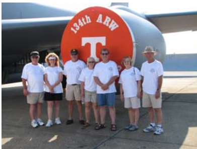
Part of the gang waiting their turn for a tour of the tanker.