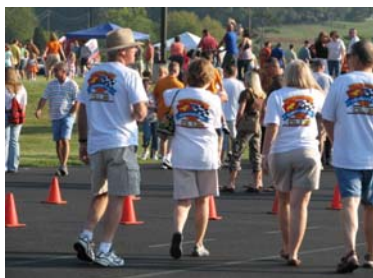
Good advertisement for ETCC!