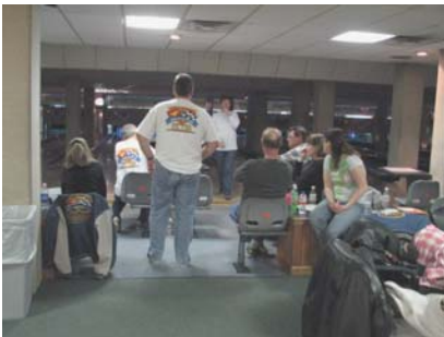
Saturday night bowling...