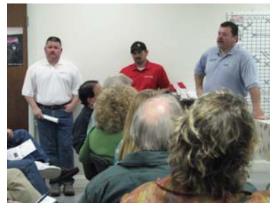
Reeder Staff at February Meeting