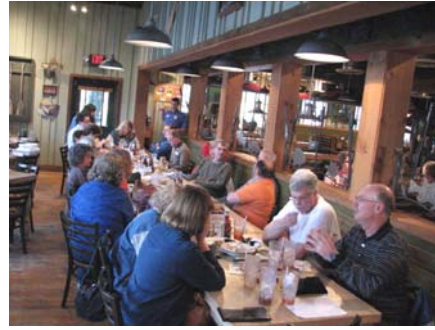
Up The Creek for dinner.